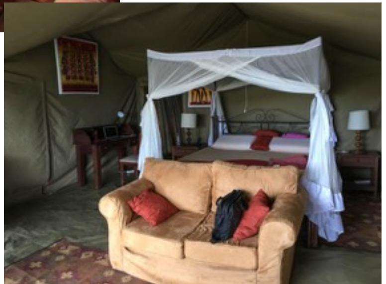
Family Tent Interior