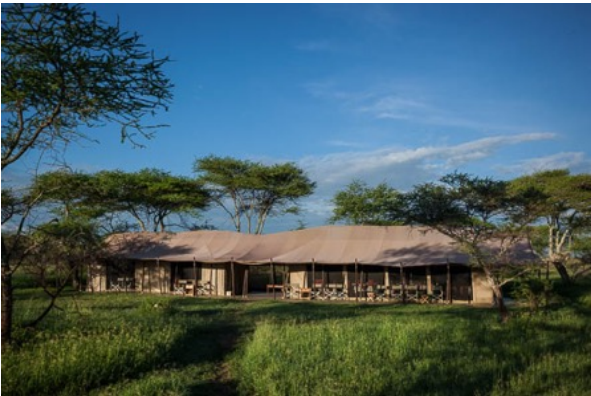
Central Dining Tent and Bar