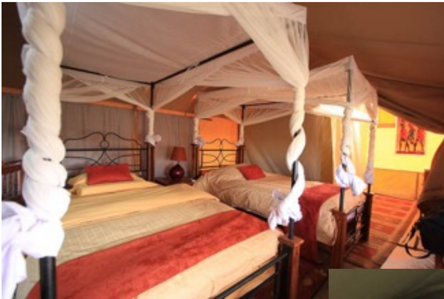
Two Person Tent Interior